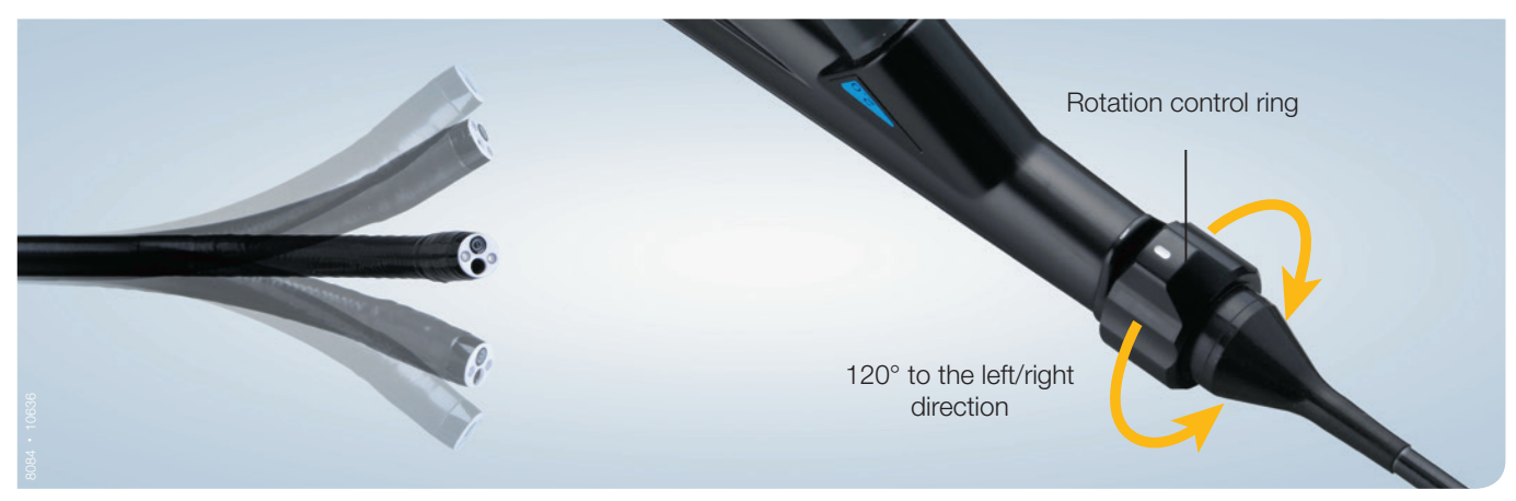
Figure 3. The insertion tube rotation function.

Figure 2. By simply turning the control ring, the distal end of the scope can be rotated left (A) or right up to 120° (C).